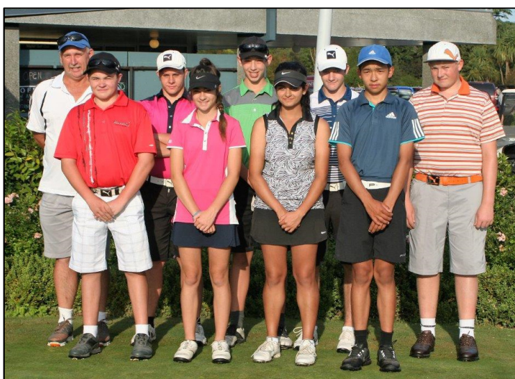
The Junior Interclub team

Any 18 holers who haven't got the time or energy to play a full round would also be very welcome to join us on a Tuesday morning.