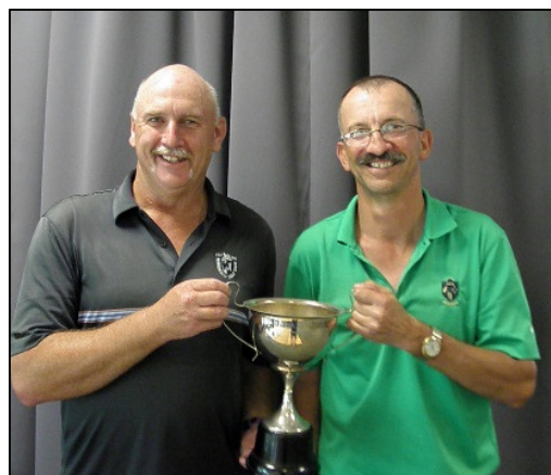
Manawatu & Feilding – joint winners of the Interclub.

The women's salver was a close call with only one point in it but unfortunately not in our favour. Good luck for the rematch in June!